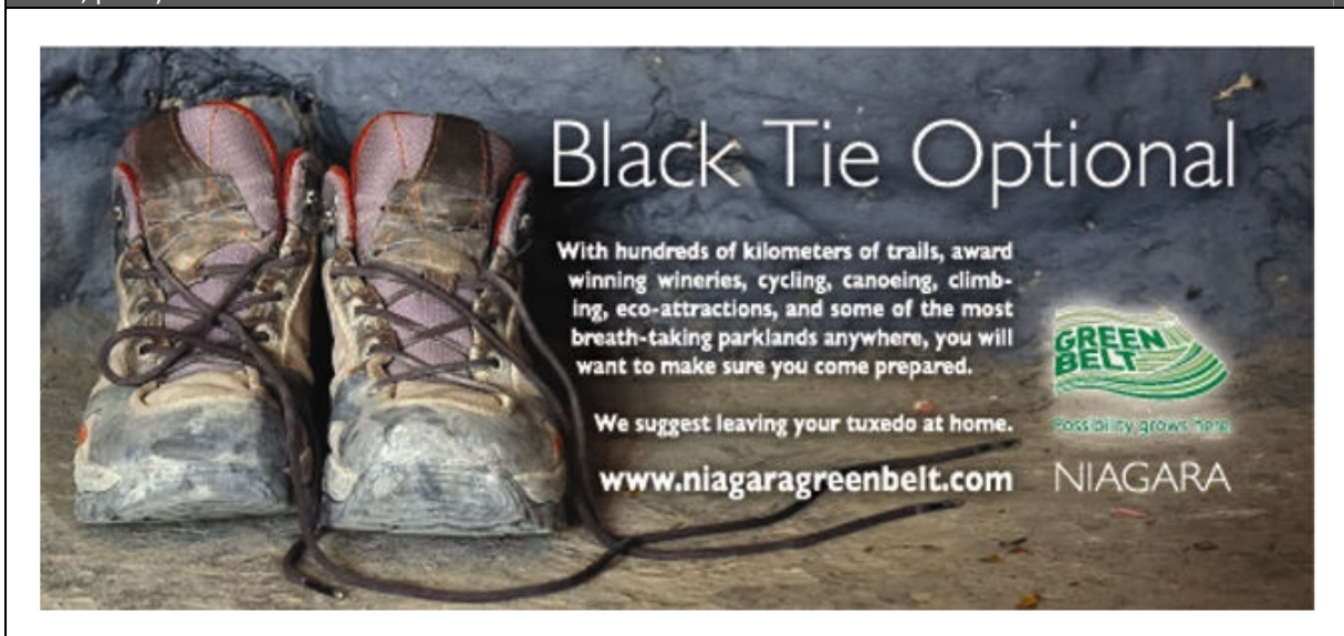
Figure 2: Sample print ad for the Niagara Greenbelt gateway website ( Escarpment View magazine, Autumn 2008, p. 10)

A series of print advertisements (see example, Figure 2) will be launched in targeted publications to promote the website, and site visitors will be encouraged to contribute to the POI pages, tour profiles, and digital media archives associated with the Niagara Greenbelt.